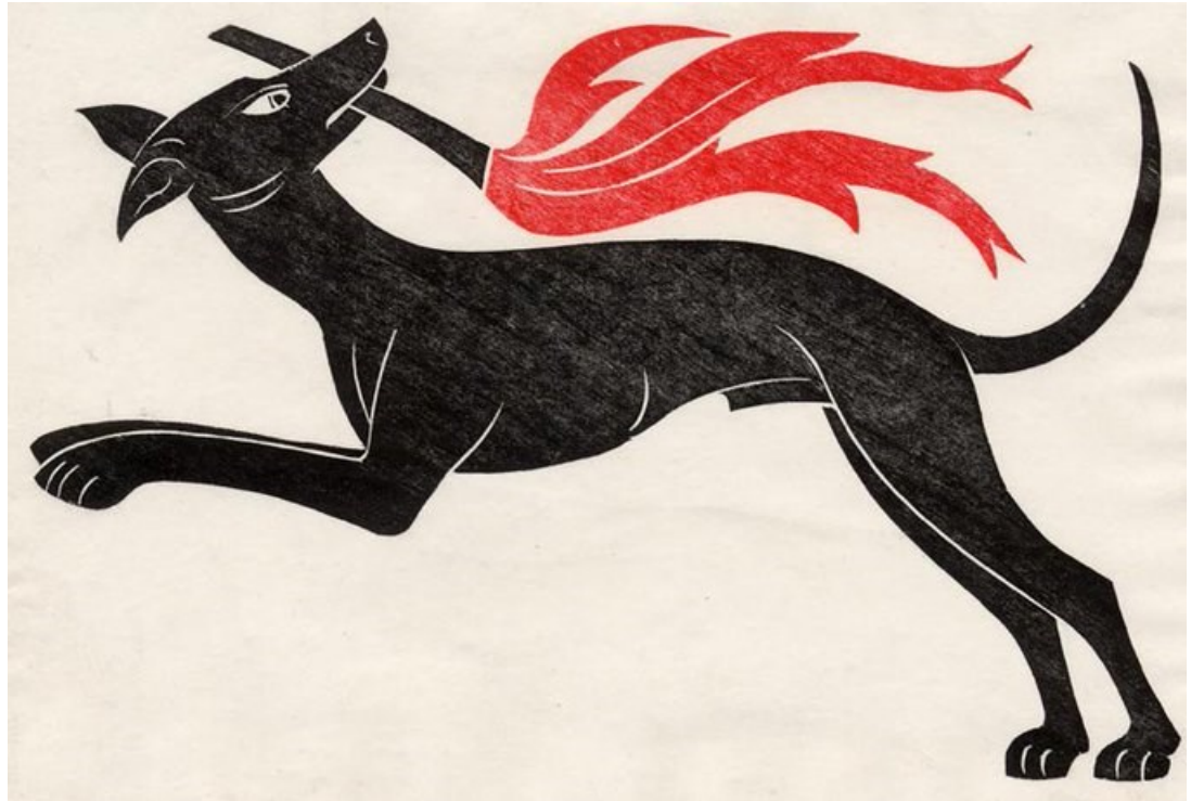
The 'Hound & Torch' emblem was the symbol of the Guild of St Joseph and St Dominic, an early 20th c. Distributist community in Ditchling, Sussex.

The Hound will also publish the dates and times of all party events along with any other events deemed to be in our interest to attend.